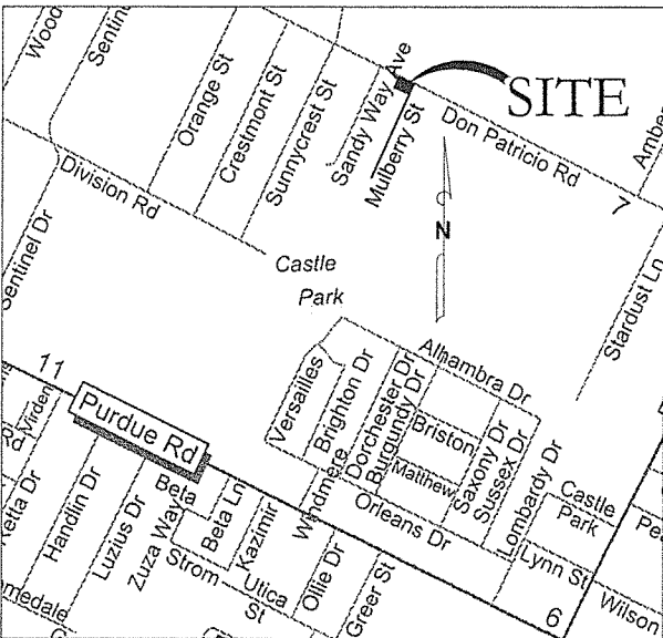
VICINITY MAP (NTS)