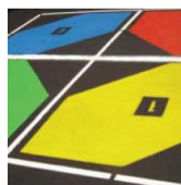
Asphalt Games / Painting