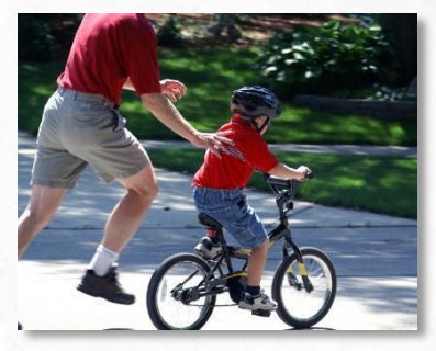
Account Management For both you and the riders

Our team provides you with the marketing materials and support needed to successfully promote your program to your riders.