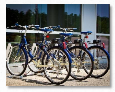
Hardware Everything you need

We provide the bikes, the racks and the technology that is ready to go upon arrival.