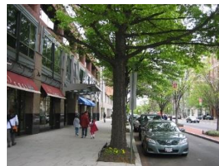
Figure 3: Streetscape should maximize tree canopy.

The Board retains the ability to alter requirements specified under these standards for individual projects. Applicant can request consideration of alternative design solutions to achieve intended goals. Designs must adhere to the Coding and Zoning requirements from the City of Corpus Christi.