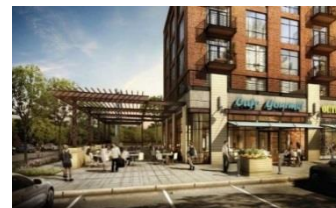
Figure 1: Outdoor Cafe