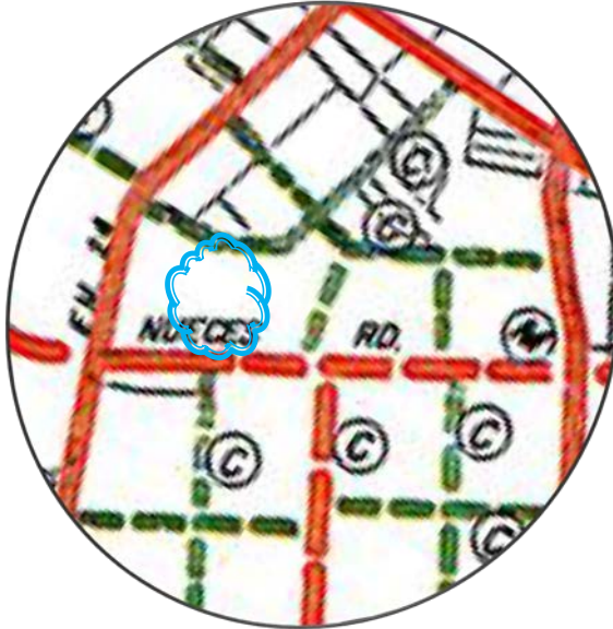
1963 UTP Map

Widgeon Drive, Designated as a Collector South of Nueces Rd (Haven Rd)