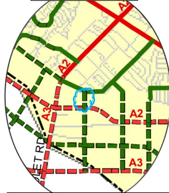
2003 UTP Map

Coverdale St./Widgeon Dr, Extended North of Haven Rd