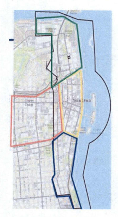
Exhibit A - Boundaries & Land Use