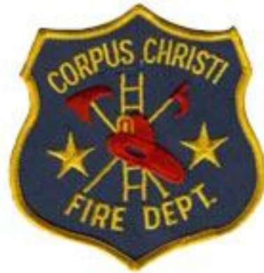
Fire Department Patch