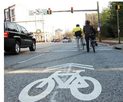
Bike Boulevard Pavement Marking

This item includes the payment of $64,500 to TXDOT for administration and oversight support.