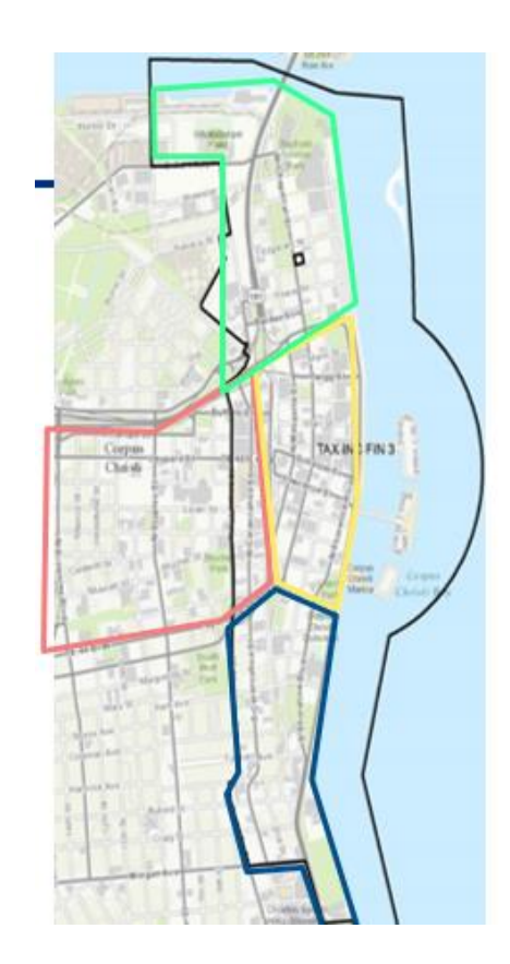
Exhibit A – Boundaries & Land Use