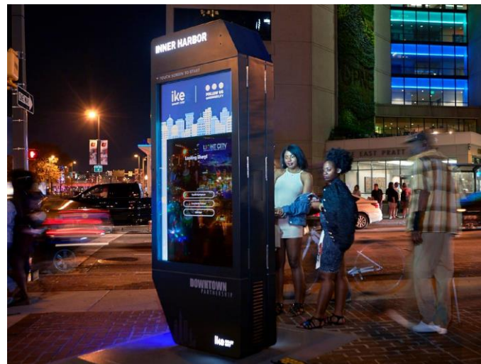
Ike kiosk in Downtown Baltimore