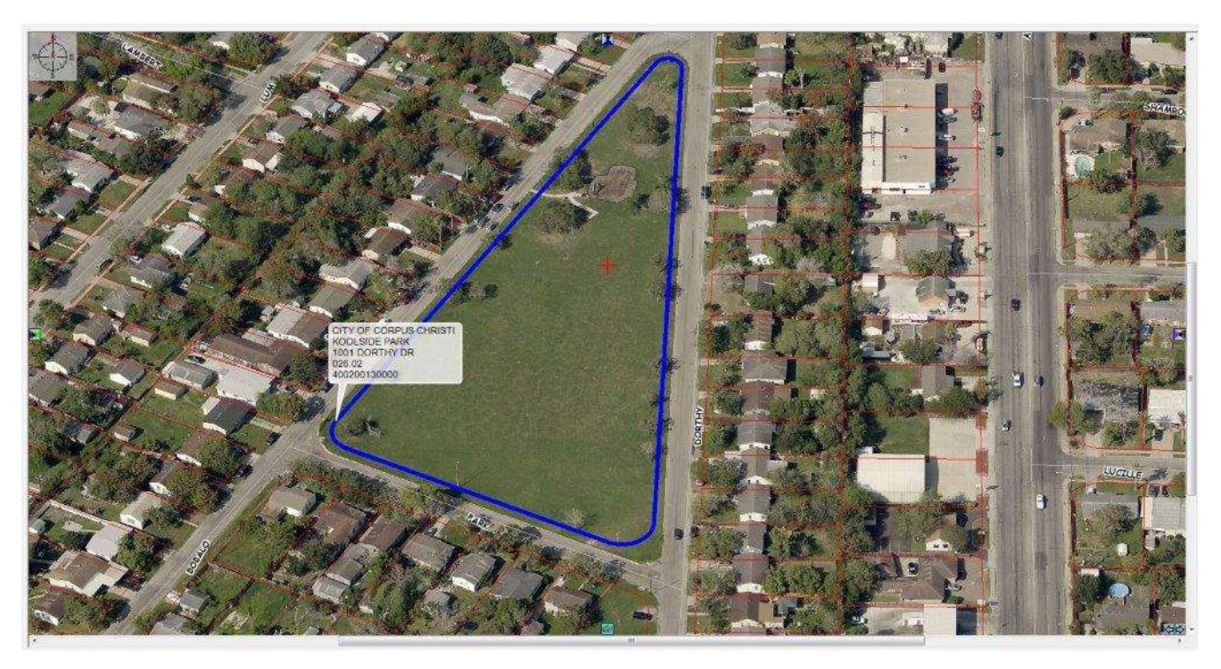
Holly 3.28 AC