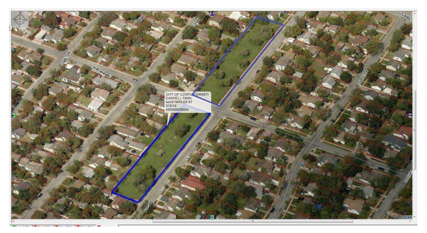
Cuiper 2.41 AC