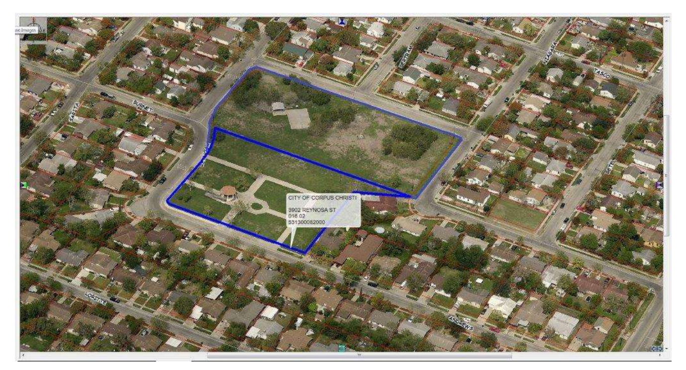
Westgate 1.51 AC