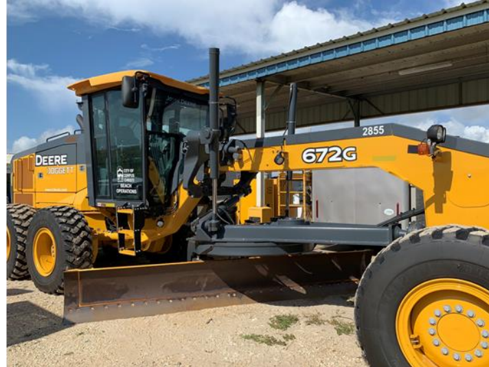
John Deere 672G Motor Grader