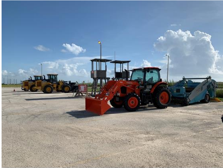
Tractor w/ Beach Cleaner