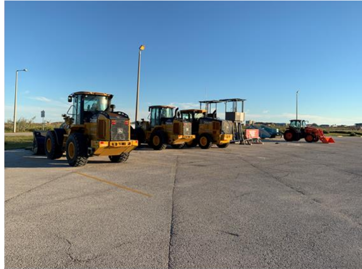
John Deere 544K Loader