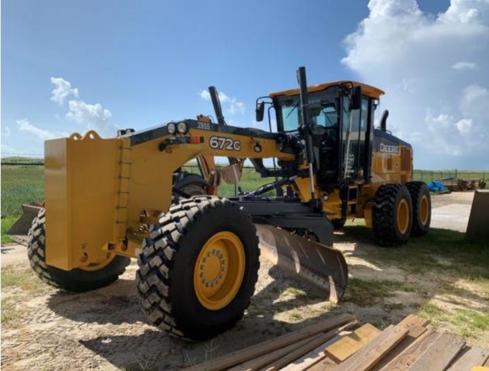
John Deere 672G Motor Grader