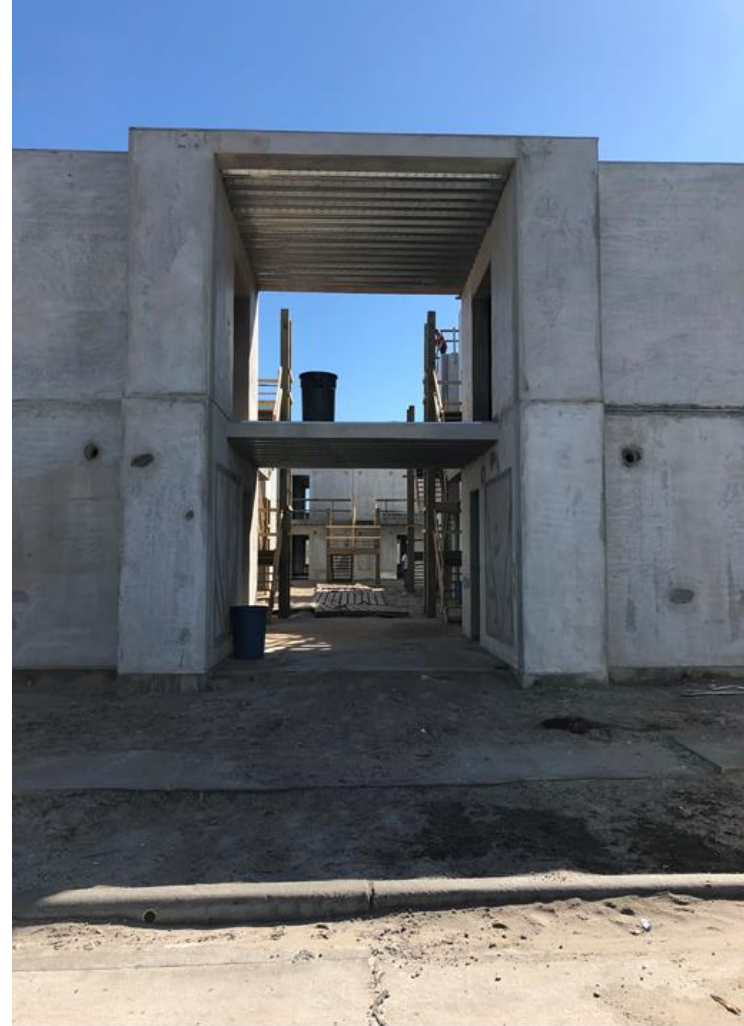
118 Las Aves Ct.