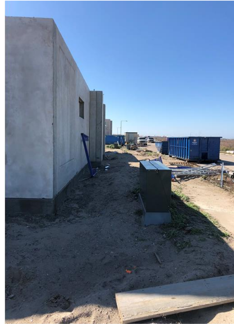
123 Rum Cay Ct.