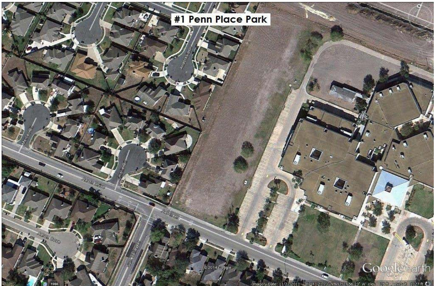
Exhibit 1 – Group 11 Maps