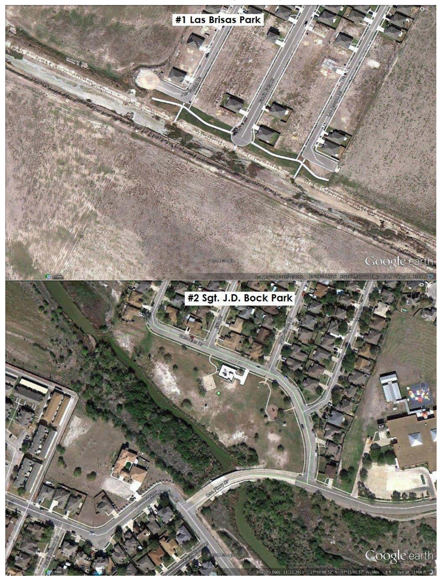
Exhibit 2 - Group 12 Maps