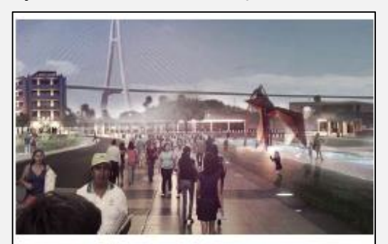
Complete a waterfront park and trail network.