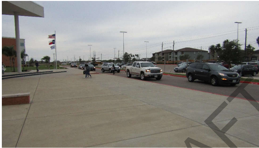
AM Drop-Off Entering

Parents entering the Campus were using the near curb lane to park and drop-off kids for a distance of over 400 feet and maneuvering left to proceed towards the exit as shown below.