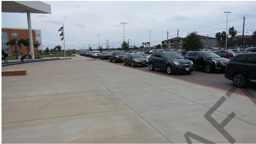
PM Pick-Up Entering

Parents parked near the curb lane for pick-up stacked up throughout the entire loop road. As students were picked-up parents would maneuver left and proceed to the exit.