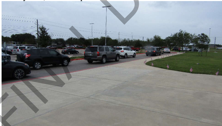
AM Drop-Off Exiting

Parents exiting the Campus proceeded straight or maneuvered left and headed towards the exit. 2 lanes of traffic merged into 1 lane near the exit and proceeded onto the City street. Exiting onto city street is a right-turn only lane, which helped move traffic.