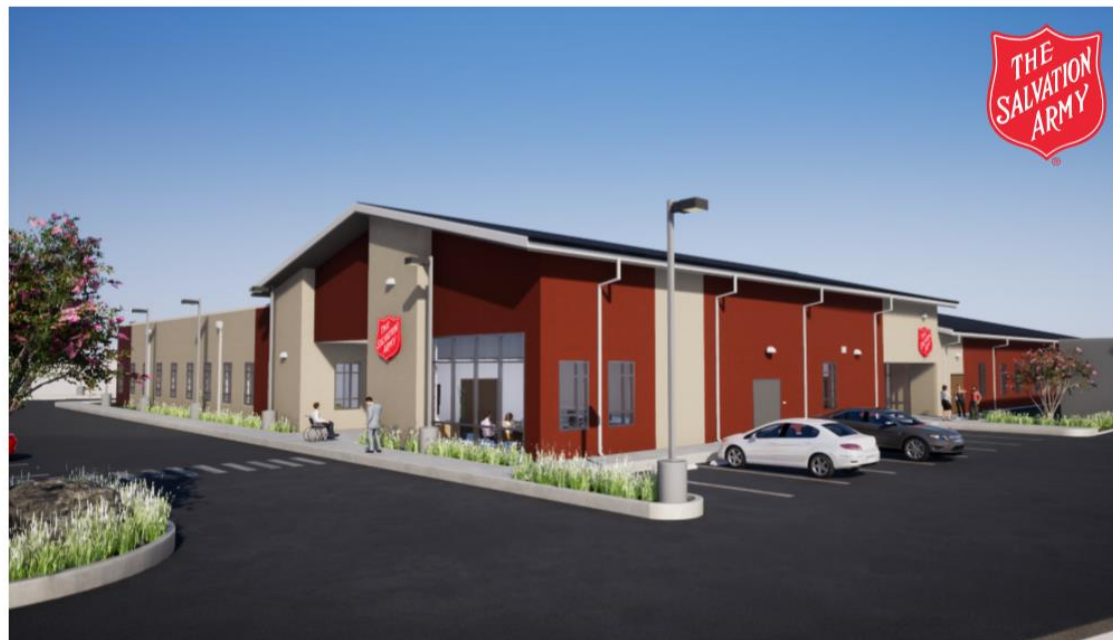
PERSPECTIVE - MAIN ENTRY