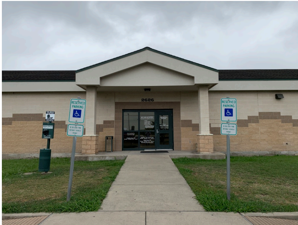
Animal Control Building