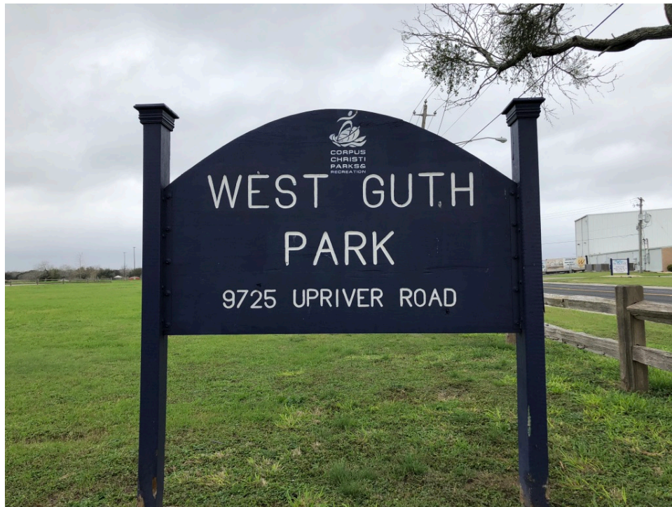
West Guth Park