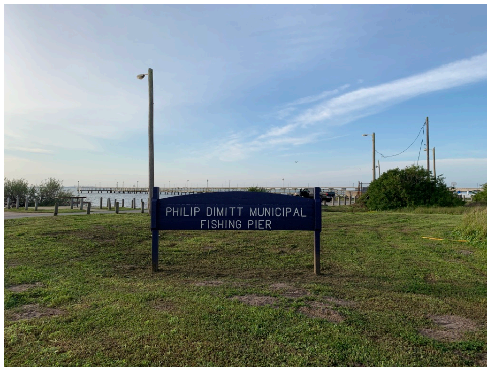
Philip Dimitt Municipal Fishing Pier