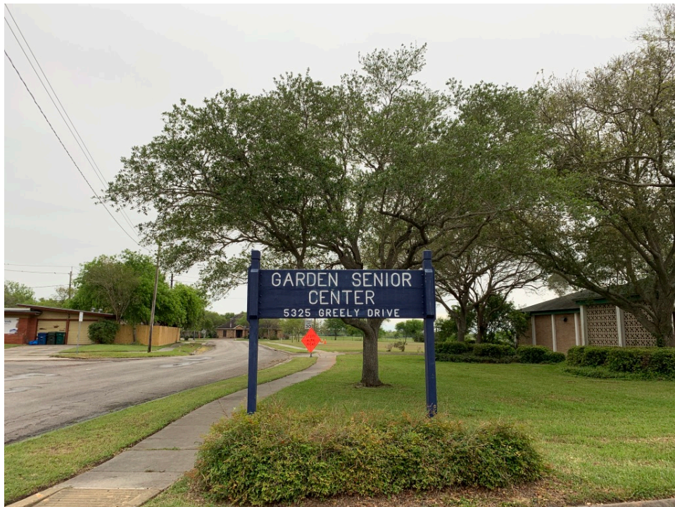
Garden Senior Center