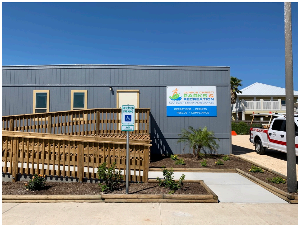
Beach Operations Building