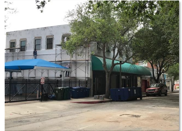
PRODUCE FACADE RENOVATION PLANS