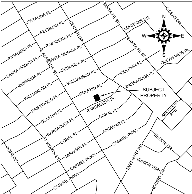
VICINITY MAP (1" = 500 FEET)