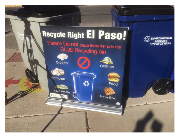
Figure 4-1: Recycling Contamination Poster: El Paso, TX

Residents who do not want to participate in the curbside recycling program can ask to opt out of the program. However, the resident's monthly $19 "Gray Trash Bin" fee will remain the same since the ESD does not charge an extra fee for recycling.