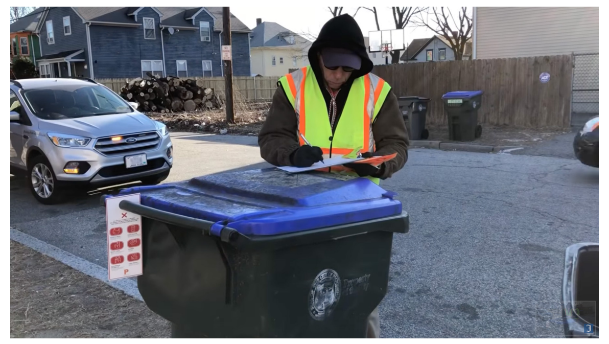
Figure 4-2: Providence DPW Inspector inspecting a recycling container

Providence implemented the cart inspection/rejection and fine issuance program to address fees that assessed by the Rhode Island Resource Recovery Corporation (RIRRC) when city recycling loads are found to be too contaminated. RIRRC can reject recycling loads at its MRF if their contamination rates are above 10 percent, but typically accepts loads with contamination in the range of 30–40 percent. If a city recycling load is rejected for excessive contamination, the city is charged a $250 rejection fee, plus the cost of disposing of the entire load at the state's Central Landfill (currently $47 per ton).<sup>16</sup> The major contaminants found in curbside recycling bins are plastic bags and food scraps. Participation in recycling programs is mandatory in Rhode Island.