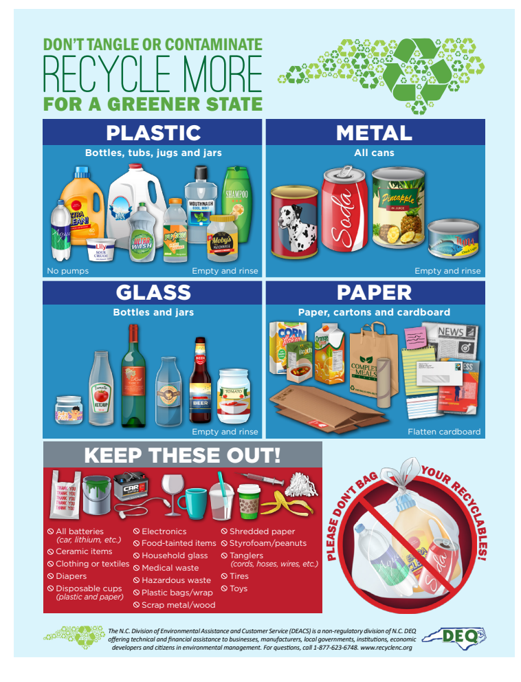
Figure 2-1: State of North Carolina Recycling Education Poster