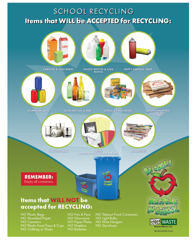
Figure 2-2: North Carolina County: Recycling Education Poster