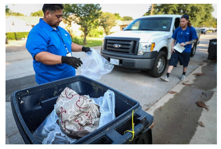
Figure 3-3: Fort Worth's Blue Crew bag non-recyclable items from the blue bin