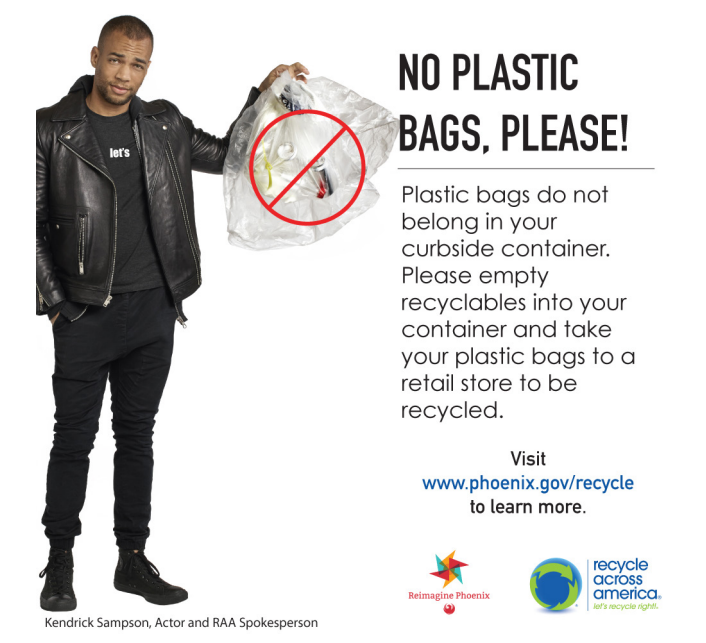
Figure 3-2: Recycling Contamination Post: Phoenix, AZ