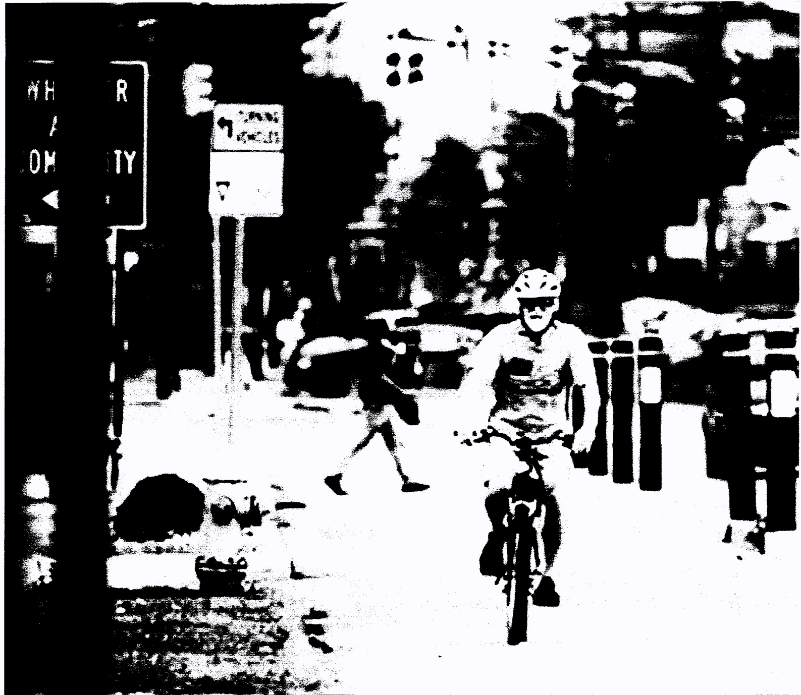
Indianapolis, IN