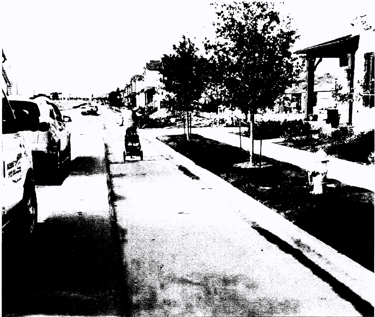
Austin, TX

Concrete curbs can either be cast in place or precast. This element is more expensive to construct and install but provides