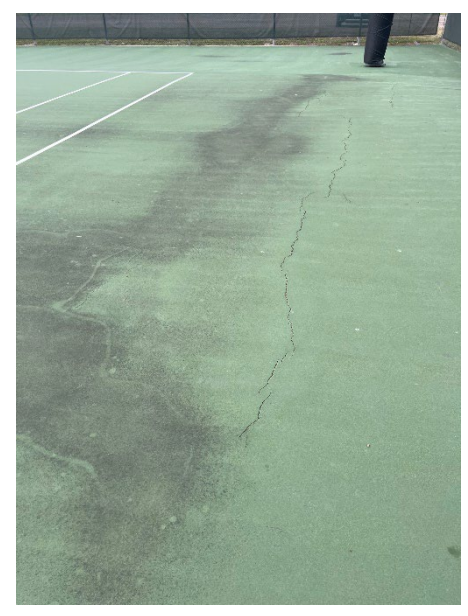
Staff proposes to resurface 7 courts at Al Kruse (D1)