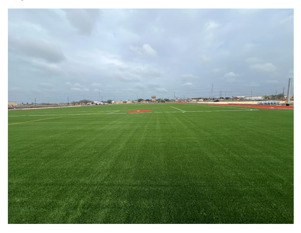
Turf Field B