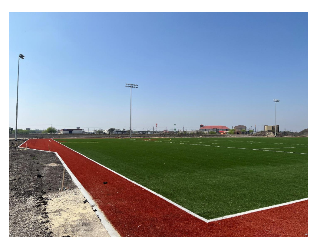
Turf Field with Sports Lighting